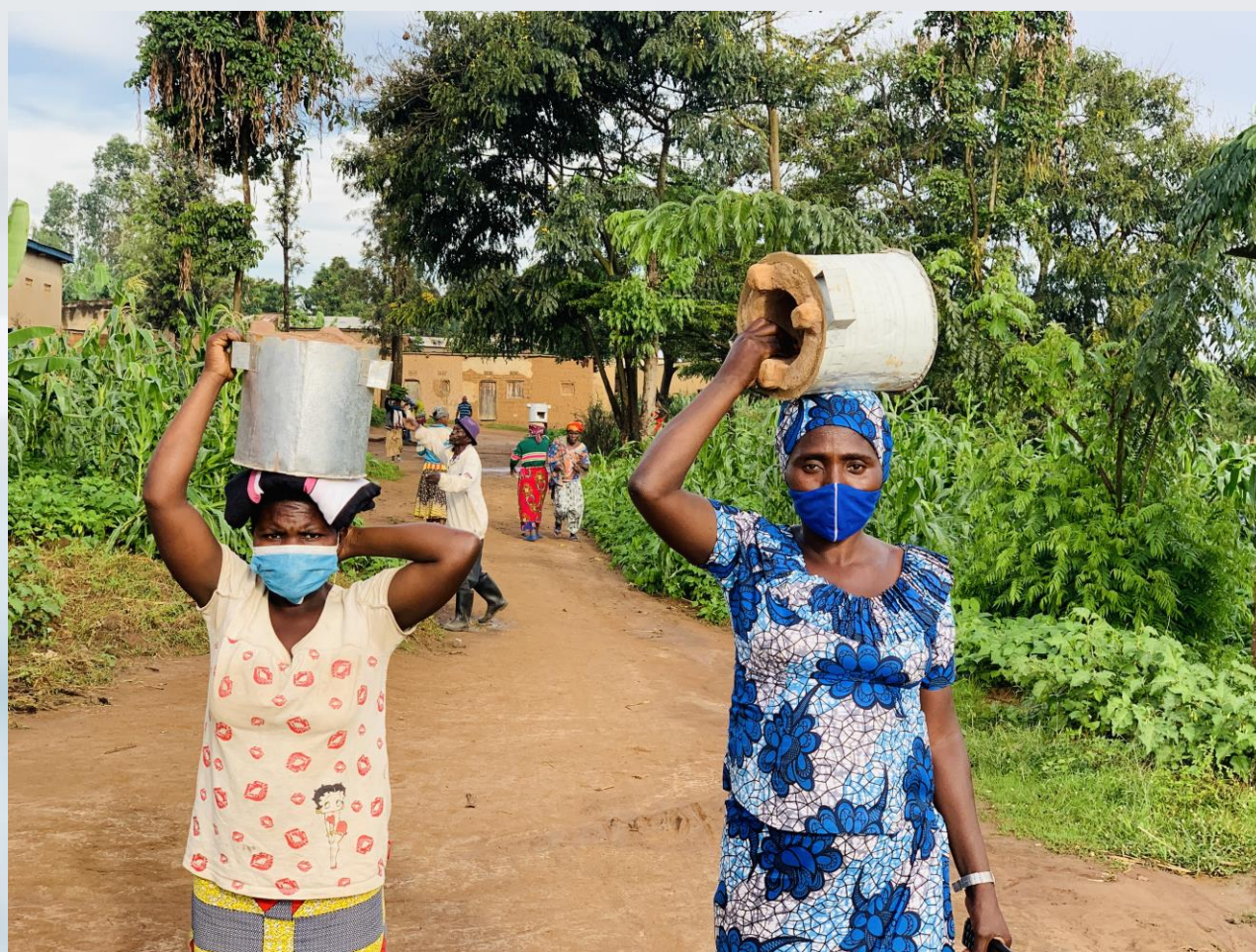
The contribution & participation of women in Environment protection and climate change resilience