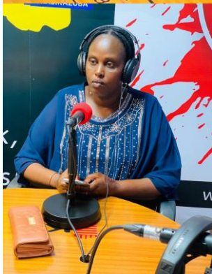
TUGANIRE KU BUZIMA BW'IMYOROROKERE

Save Generations organization funded by Kvinna till Kvinna conducted 3 sessions of radio talk shows called "Tuganire ku buzima bw'imyororokere" or "Let's talk about sexual reproductive health and rights" on KT Radio Rwanda 96.7 FM. Where the program is broadcasted every third week of the month from March to June 2022, the program intends to disseminate SRHR information to adolescents and youth mainly the project and non-project right holders and to challenge negative social norms around talking about SRHR publically.