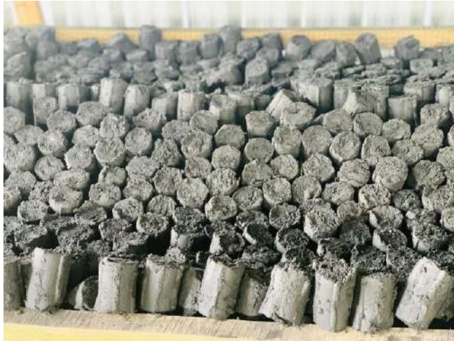
30 cooperative members gained knowledge on how to make carbonized briquettes