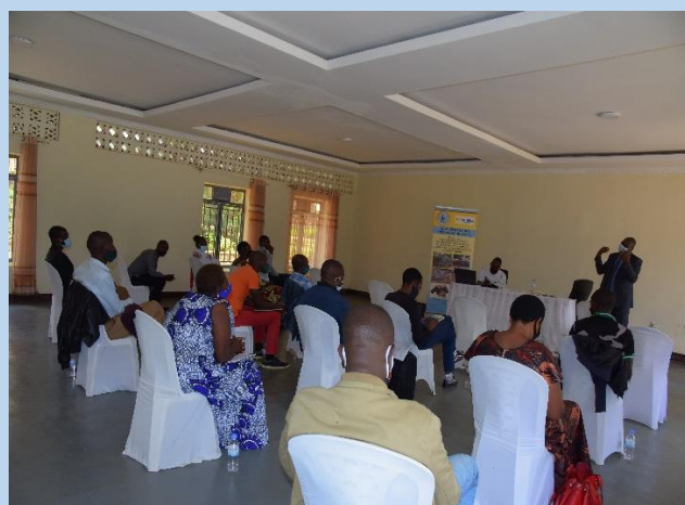
Stakeholder's workshop gathering different institutions, local district staffs working on Environment and climate change