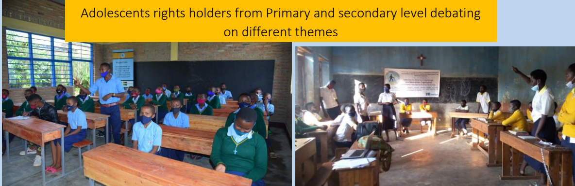
Adolescents rights holders from Primary and secondary level debating on different themes

In order to increase access to SRHR information and knowledge to new right holders, after being trained on SRHR, 480 SRHR booklets were multiplied and distributed to 240 right holders (160 girls and 80 boys) and their peers. With these materials, right holders were enabled to reach and disseminate the acquired knowledge but also keep sharpening their knowledge with the booklets in their hands.