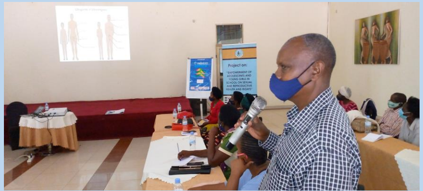
Trained male parents shared their commitment on mobilizing other parents to spare enough to talk with the children on SRHR.

Trained men committed to change their attitude and aimed at mobilizing their fellow men towards their engagement in SRHR considered as women's responsibilities and increased their support to teach their adolescents about SRHR and gender promotion.