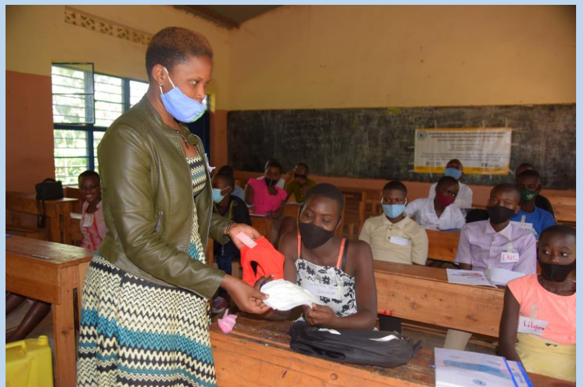
240 rights holders from targets schools trained on Sexual Reproductive Health and Rights

240 Rights holders and duty bearers are equipped with accurate information on SRHR, and rights holders increased power to make informed and responsible decisions over their bodies and to claim their SRH rights in an informed and supportive community.