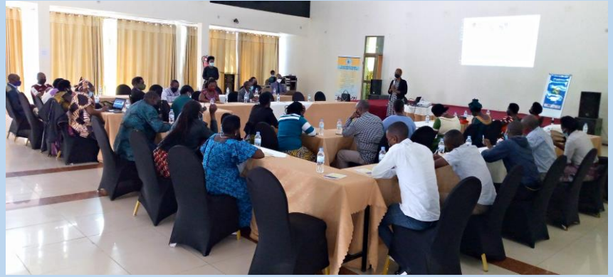
Duty bearers shared their new knowledge acquired during SRHR training

Negative perceptions of the community around SRHR that it is taboo to discuss about it because it is against culture are reduced and increased their support in SRHR promotion, where by trained duty bearers (parents and teachers) changed their attitude and increased their responsibility to discuss with their children about SRHR as one of their rights and the access to SRHR services such use of condoms but safe abortion still a challenge due to religious beliefs.