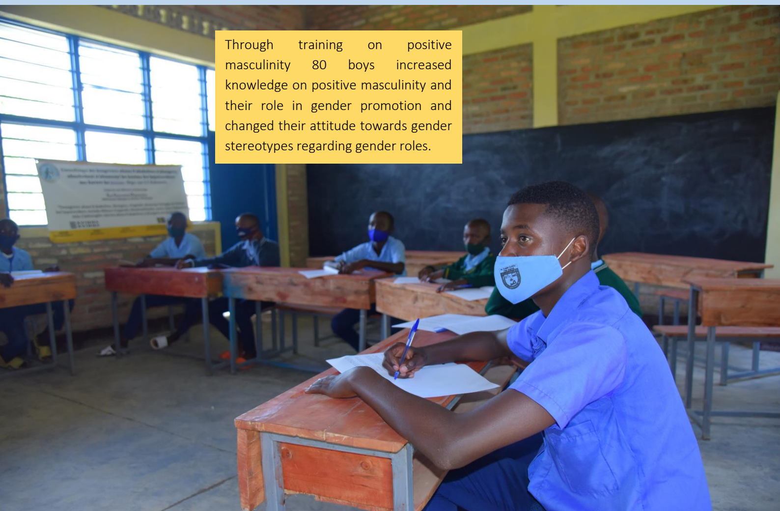
Project rights holder (Adolescent's boys)

Through training on positive masculinity 80 boys increased knowledge on positive masculinity and their role in gender promotion and changed their attitude towards gender stereotypes regarding gender roles.