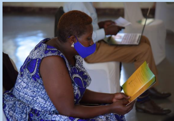
465 booklets have been distributed to the youth cooperative members to increase awareness on project activities.

2 steering committee meetings were conducted, elected steering committee at district level and Steering committee at the sector level) with the objective of increasing the ownership and engaging local authorities, community in the project activities which yield great impact on the sustainability of the project activities even after project funds.